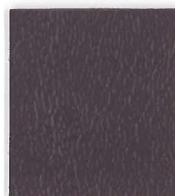
CAO-20 Purple Grey