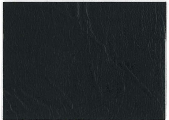
CAO-31 Oxen Black