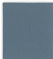
CAO-16 Colonial Blue