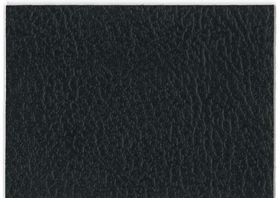
CAO-32 Madrid Black