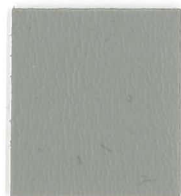
CAO-27 Light Grey