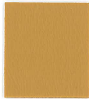
CAO-04 Golden Tan