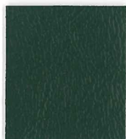
CAO-23 Dark Green