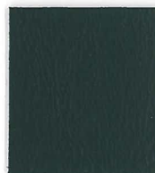
CAO-24 Hunter Green