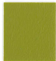
CAO-21 Pale Green