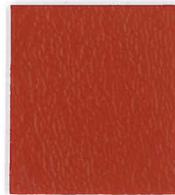
CAO-07 Terra Cotta