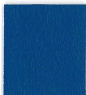
CAO-14 Royal Blue