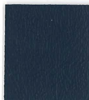
CAO-17 Midnight Blue