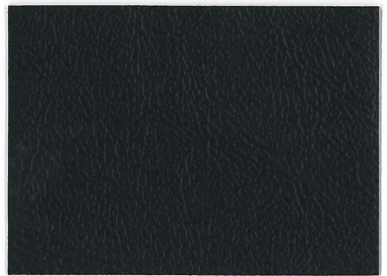
CAO-30 Sierra Black