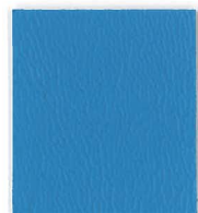
CAO-13 Harbor Blue