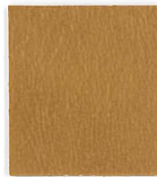
CAO-02 Leather Saddle