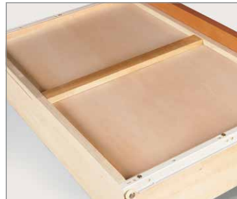
Mortise and tenon support rail adds durability