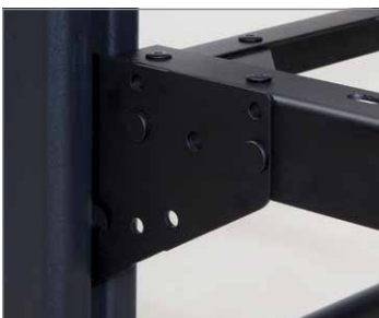
Merit metal beds use steel welded construction for maximum strength and radius frame corners to eliminate sharp edges