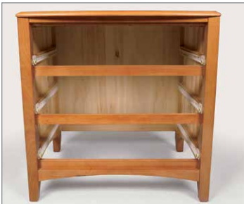
Solid wood posts for maximum structural support