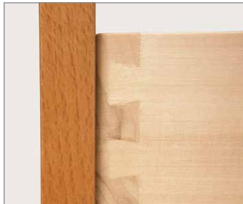
Hardwood drawer box construction with double drawer fronts and English dovetail joinery for extra strength