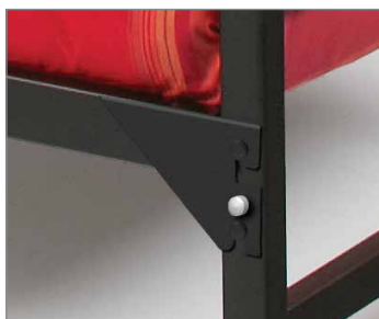
Sealed surface frames that eliminate hiding places that harbor bed bugs