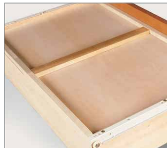
Mortise and tenon support rail adds durability