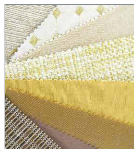
Butler offers over 500 vinyl fabric options with features that will help your furniture last longer and look better with everyday use