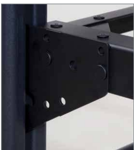
Merit metal beds use steel welded construction for maximum strength and radius frame corners to eliminate sharp edges