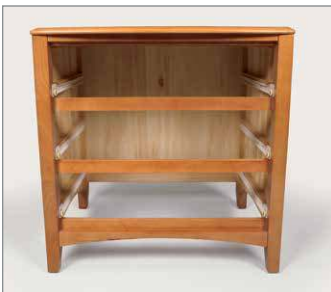
Solid wood posts for maximum structural support