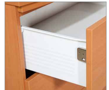
Merit powder coated steel drawer bodies offer maximum strength and easy-clean structure