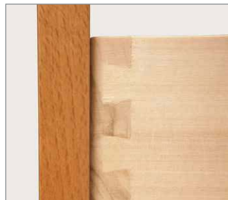
Hardwood drawer box construction with double drawer fronts and English dovetail joinery for extra strength