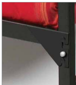
Sealed surface frames that eliminate hiding places that harbor bed bugs