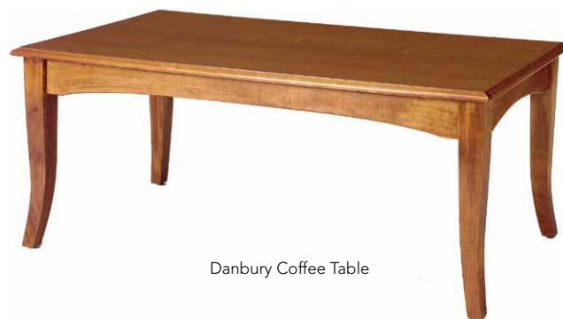
Danbury Coffee Table