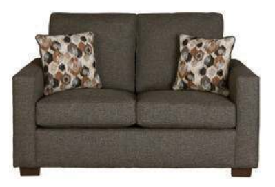
7980212 Lexington Loveseat (Charcoal Tweed Fabric/Multi-Colored Abstract Pillows)