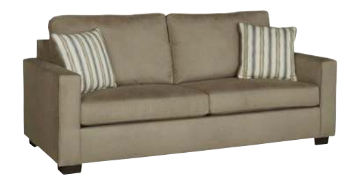
7980213 Lexington Sofa (Stone Microfiber Fabric/Multi-Colored Abstract Pillows)