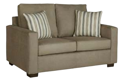
7980212 Lexington Loveseat (Stone Microfiber Fabric/Multi-Colored Abstract Pillows)