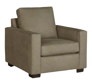
7980211 Lexington Chair (Stone Microfiber Fabric)