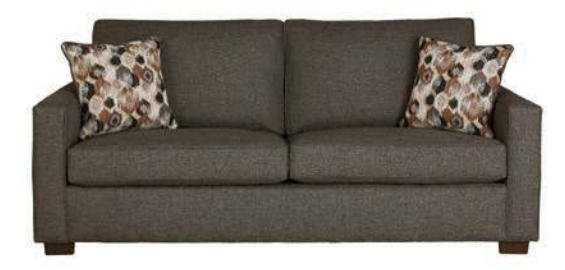
7980213 Lexington Sofa (Charcoal Tweed Fabric/Multi-Colored Abstract Pillows)