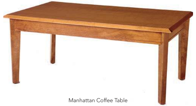
Manhattan Coffee Table