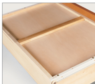
Mortise and tenon support rail adds durability