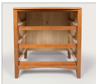
Solid wood posts for maximum structural support