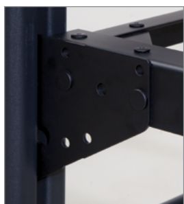
Merit metal beds use steel welded construction for maximum strength and radius frame corners to eliminate sharp edges