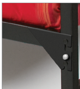
Sealed surface frames that eliminate hiding places that harbor bed bugs