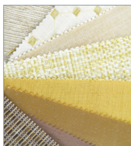
Butler offers over 500 vinyl fabric options with features that will help your furniture last longer and look better with everyday use