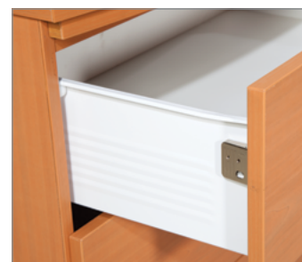
Merit powder coated steel drawer bodies offer maximum strength and easy-clean structure