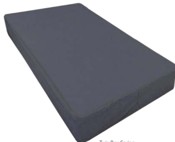
Twin Box Spring