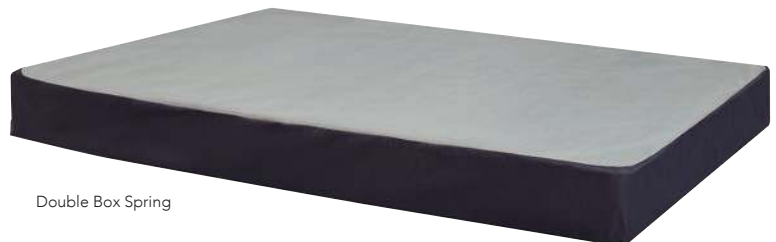
Double Box Spring