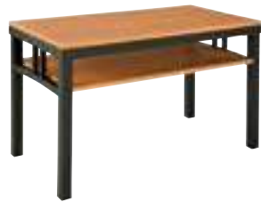
7963630 Rowan A/V Table