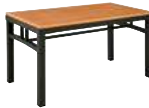
7963420 Rowan Coffee Table