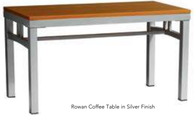
Rowan Coffee Table in Silver Finish