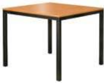
7964076 Rowan Dining Table