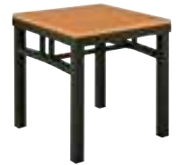
7963419 Rowan Side Table