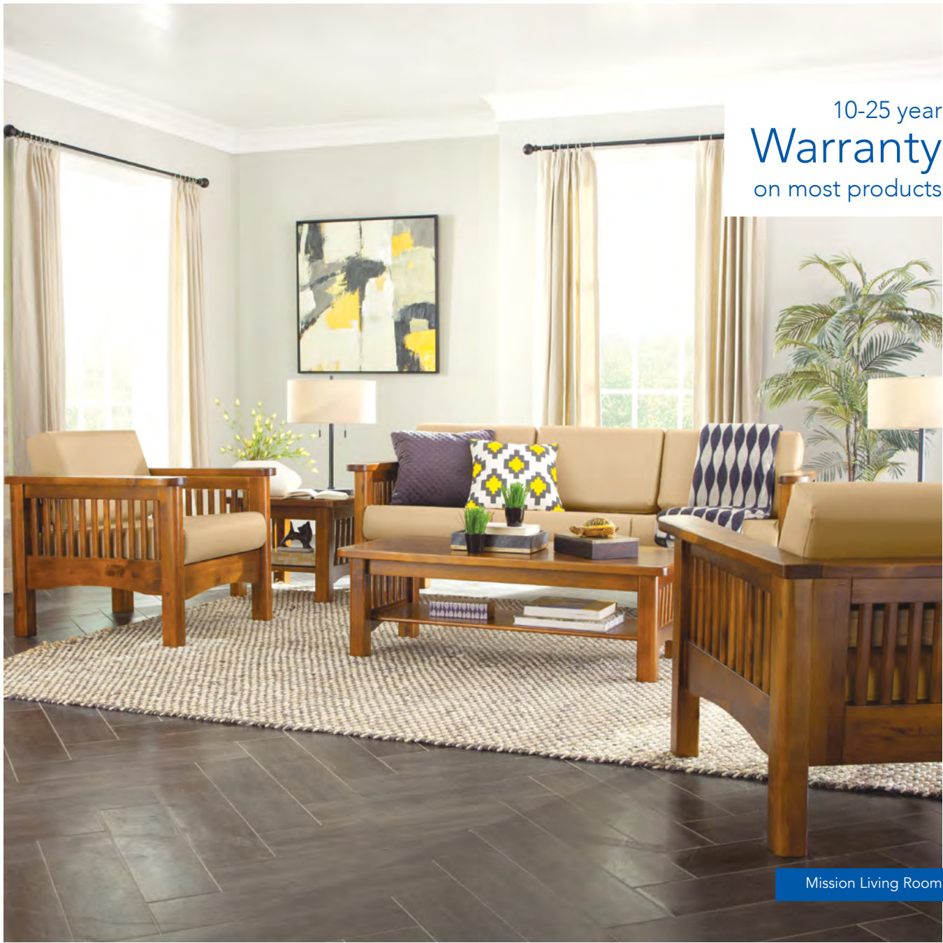
Mission Living Room