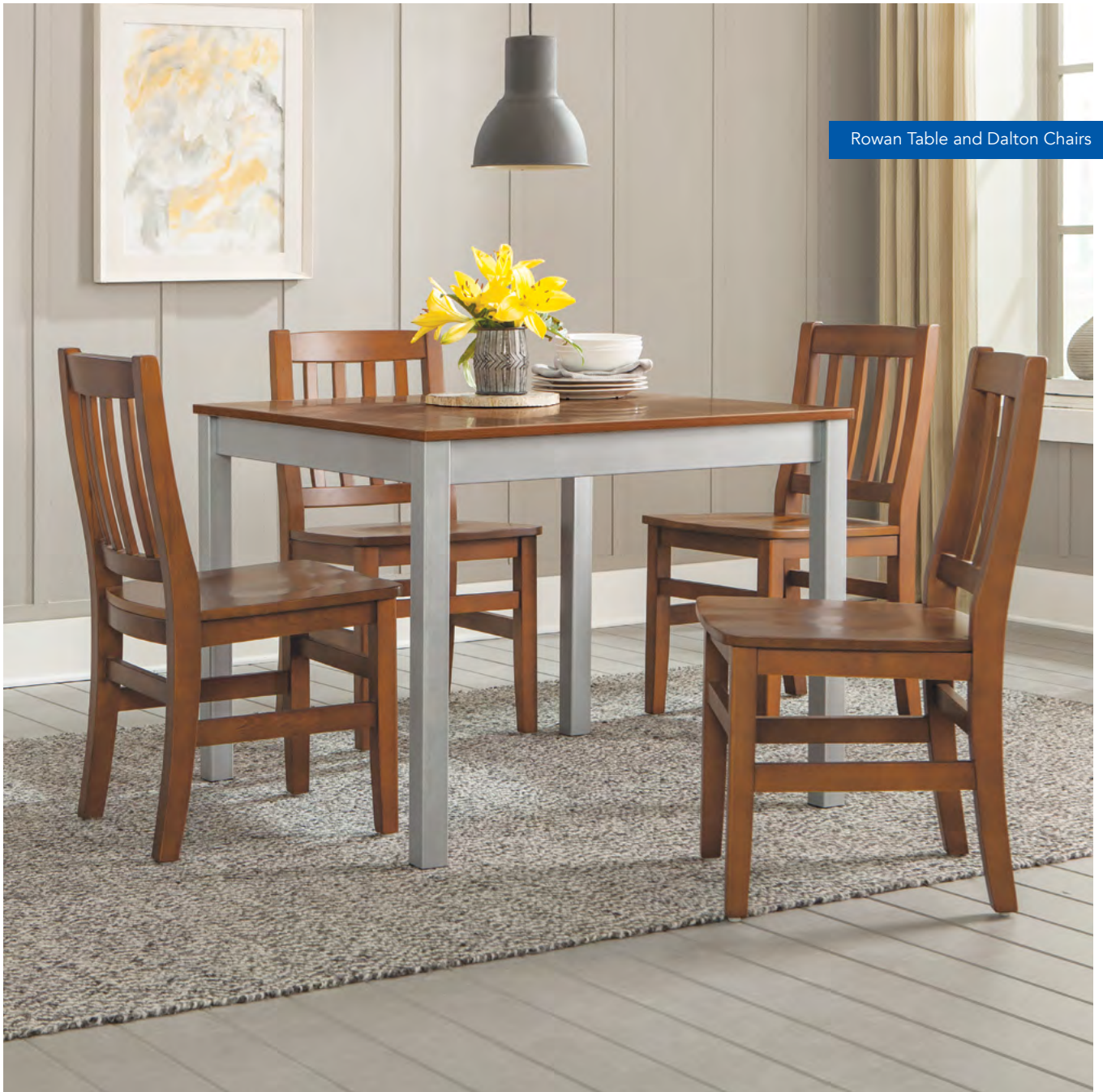
Rowan Table and Dalton Chairs