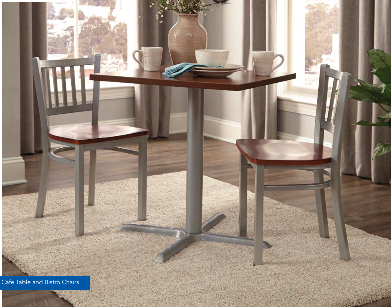
Cafe Table and Bistro Chairs